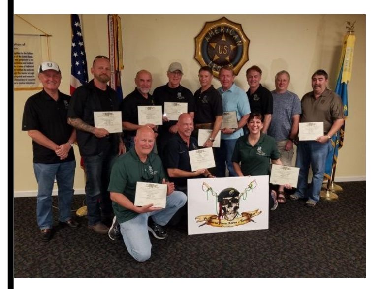
"Tip of the Beret " to the Ye Special Forces Krewe of Tampa Bay construction crew.