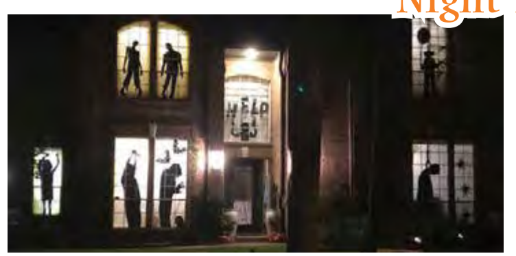
7922 Ensemble Drive