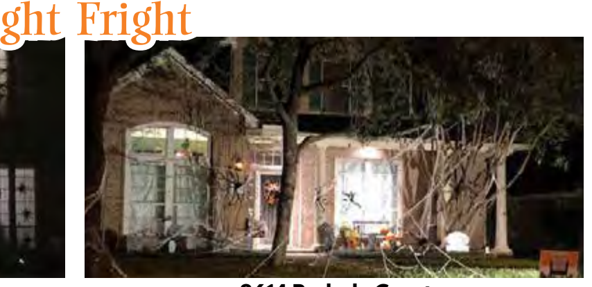
8614 Prelude Court

Copyright © 2019 Peel, Inc. Woodwind Lakes - December 2019 1