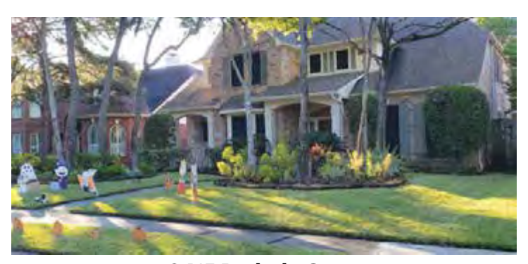
8615 Prelude Court