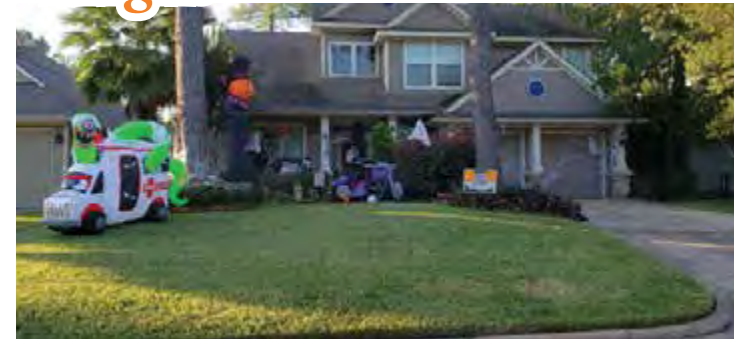
9307 Oratorio Court