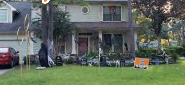
8002 Sinfonia Drive