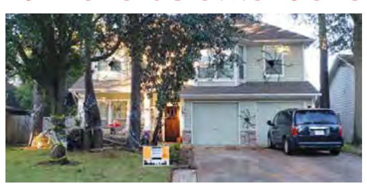
8123 Clarion Way