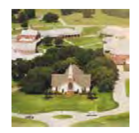
***** Tuesday, December 17, 2019 ***** BROOKWOOD COMMUNITY 1752 FM 1489 – Brookshire, TX 77423 GIFT SHOP, ART GALLERY and... LUNCH AT THE CAFÉ AT BROOKWOOD