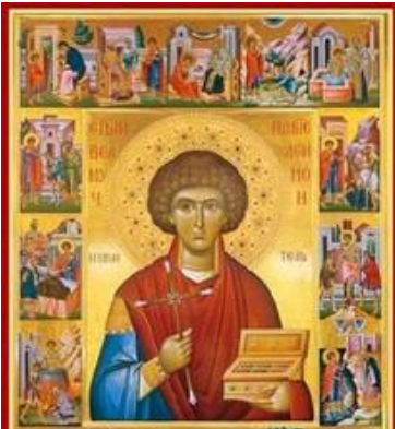
Gr. Martyr and Healer St. Panteleimon