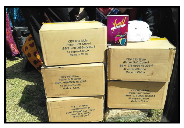
At the end of the team service came the giving of bibles to 4th graders and up. These were special bibles from MIA just for youth in a contemporary English version.