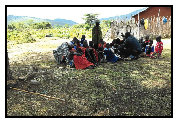
Maasai bush ministry means each vehicle has a driver, a Maasai interpreter, a Maasai who knows the area and village locations and 4-5 team members who testify, sing and preach a salvation message. We participated in two different team bush ministries with the Cheshiers.