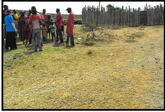
We very seldom get a camera out and take a picture as we are not there as tourists. This would be a typical setting of 10-40 Maasai under a tree. Over 2000 Maasai received the Word and repeated the sinner's prayer for salvation! We do our part and the Holy Spirit does the miraculous!