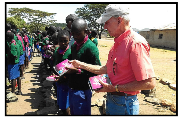
All team members pitched in to help pass out the bibles to each student. The students are all taught English and are encouraged to read the bibles to their parents who cannot read.