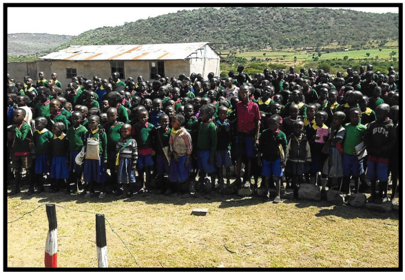
After the salvation message, the kids were taught the Word about healing, deliverance and the infilling of the Holy Spirit. The response of the kids and the outpouring of the Holy Spirit was unlike anything we have ever seen. Dozens of these kids were slain in the Spirit, filled with the Holy Spirit and lay on the ground weeping and calling out to Jesus!! Revival is happening in the bush of Africa!