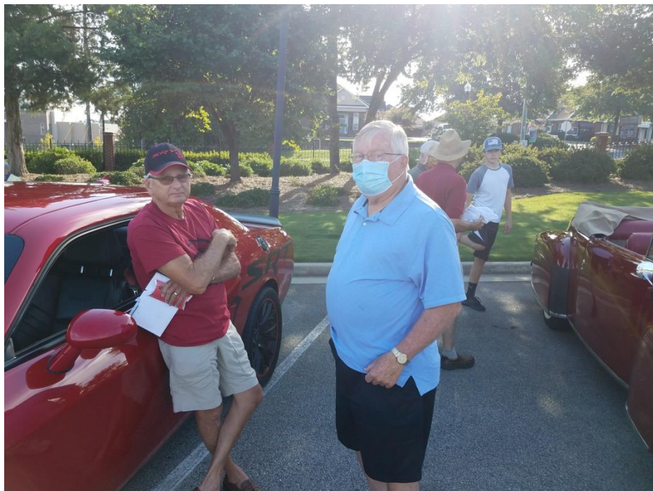
Some serious discussion