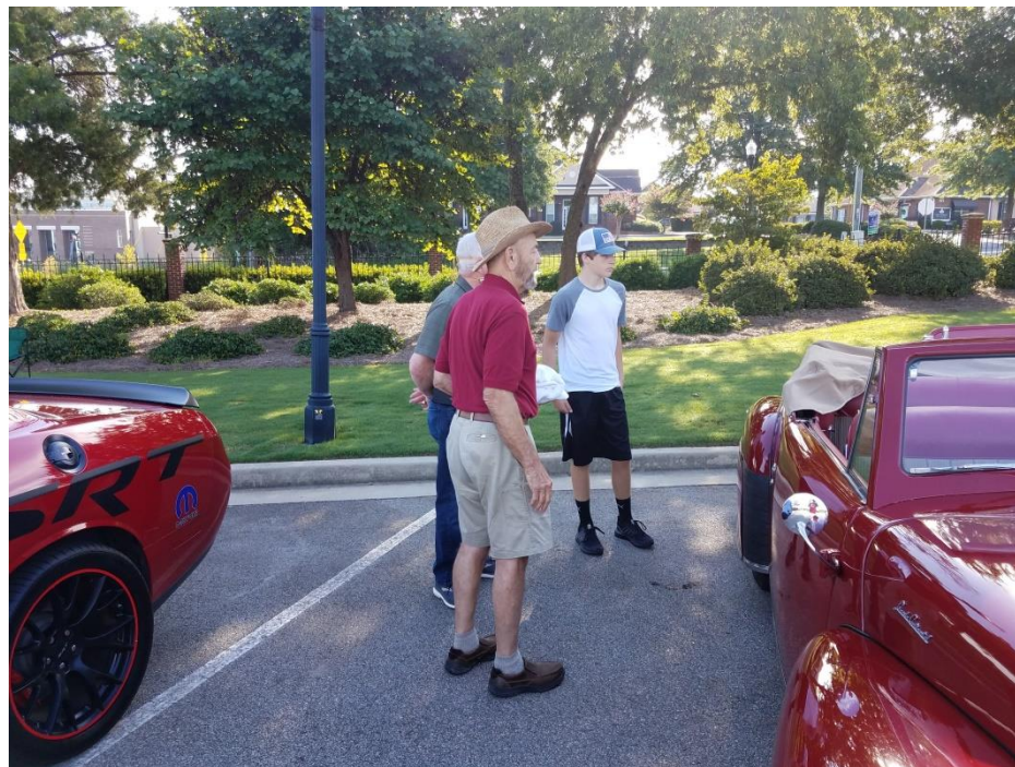
Love the hats

Official Region of the Antique Automobile Club of America