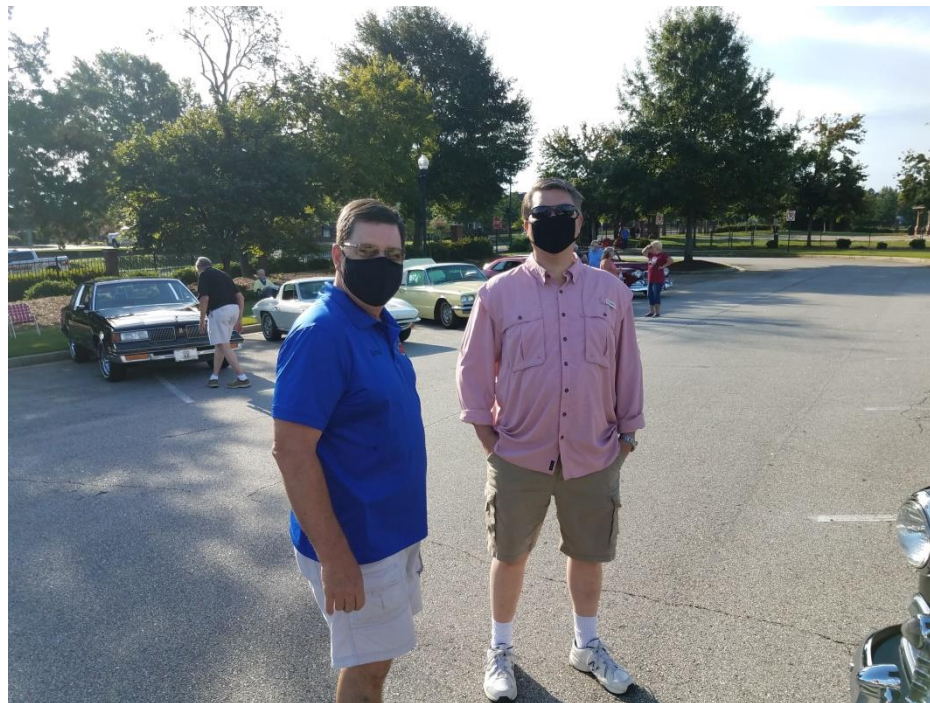
What a duo!!

Official Region of the Antique Automobile Club of America