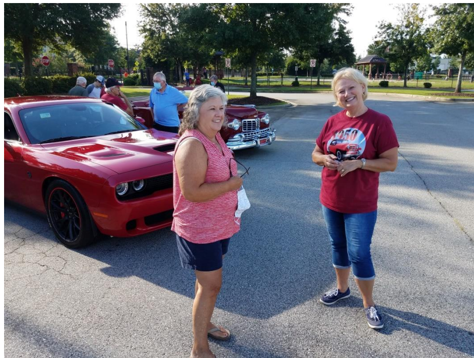
Lovely ladies (minus the background)

Official Region of the Antique Automobile Club of America