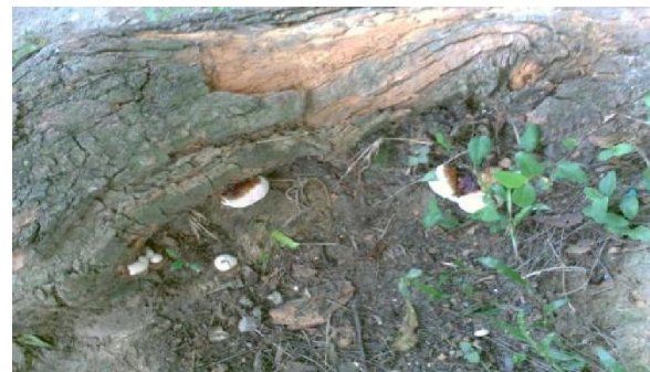
Fig.4: G. lucidum causing roots cracking and rotting of living Azadirachta indica tree

among the trees. The trees with exposed lateral roots were more susceptible to attack. However, the occurrences of G.lucidum were more severe in all trees in months of April, May, June and July than other months of the year. The trees have blemishes, shown no good adaptability to the area climatic conditions with non-satisfactory foliage production. The impacts of G. lucidum on the trees have caused cracking and rotting of the roots, cracking of the stem/trunk bark, sparse foliage and deformation of crown, and die-back of individual branches as shown in Fig. 4, 5 and 6 making them susceptible to wind damage. The impacts of G. lucidum also rendered the trees vulnerable to termite attack as shown in fig. 7 as well as many epiphytic plants such as Angel fire and Aerangis biloba . Generally, occurrence of G. lucidum has both significant ecological and economical impacts in the loss of Ornamental trees and maintenance expenses for replacement respectively.