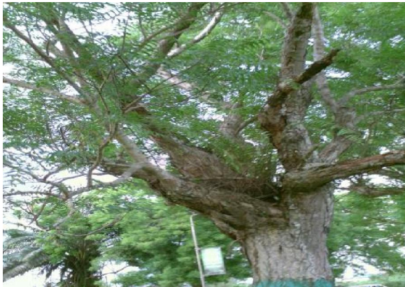
Fig.6: Die-back of individual branches on live Azadirachta indica tree