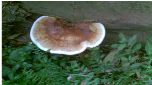
Fig. 2: G. lucidum on trunk of dead Azadirachta indica tree