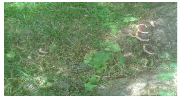
Fig.1: G. lucidum roots of living Azadirachta indica tree

The study showed that 146 or 40.78% of the initial total number of 358 trees were killed by occurrence of G. lucidum . Two types of Ganoderma were recognized: G. lucidum attacked live and dead woods; and G. applanatum attacked only dead stump/wood. The fungus is a soil and air-borne pathogen whose pronounced occurrence and wide spread were observed in rainy months of April to July. Occurrences were severe in March, August, September, October and November with less severity in December, January and February. The trends were similar for the 3 years of study as shown in table 1. In all the years, there were progressive increases in the damaging impact of G. lucidum in all trees and the total mortality associated with its occurrence was greater than 40% as at end of 2013. Other ornamental trees attacked by G. lucidum in the University premises include Casuarina equisetifolia , Delonix regia , Terminalia catappa , Terminalia superba and Mangifera indica .