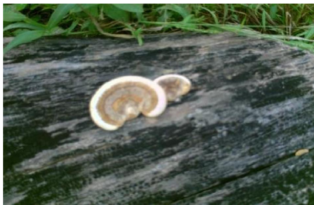
Fig.3: G. applanatum on dead trunk of Azadirachta indica tree