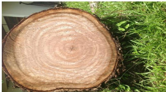
Fig. 8: A disk obtained from wind prone felled dying tree

Because G. lucidum attacked older Azadirachta indica trees, the killing impact seemed to be rather moderate or slow. However, the projection death of the remaining 59.22% or 212 trees could be fast as a result of poor condition of the trees. There is urgent need to interplant non-vulnerable trees like Gmelina arborea and harvest the avenue trees for production of furniture and other indoor wood products for the University community. A disk (Fig. 8) obtained from one of the dying tree was still hard enough without any visible xylem decay, stain, tunnel and discolouration to produce indoor wood products. The replacement of few missing stand with Delonix regia is not appropriate because D. regia is more susceptible to G. lucidum in UNIPORT and it could be attacked at tender age. More so, D. regia has undesirable buttress and lateral root pattern that could easily destroy the walk ways and even the main road.