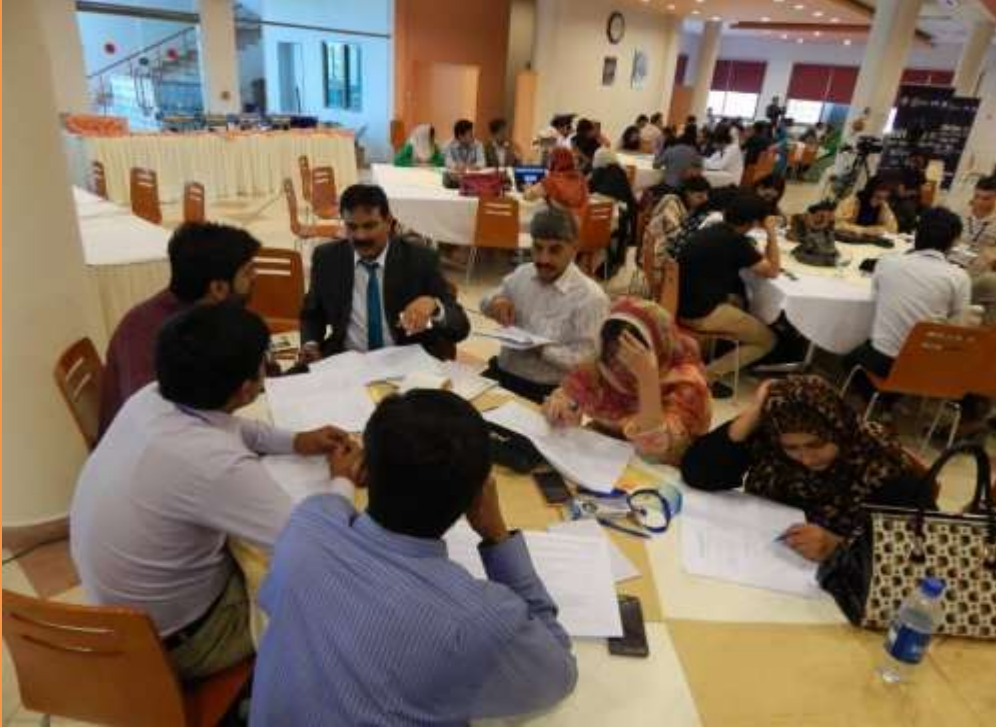
Round Table: Participants of global debate look into the questions