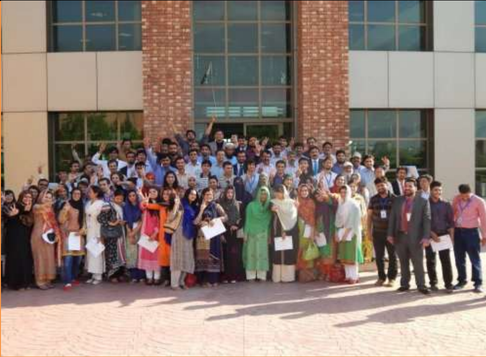
Group photo of the participants of global debate

A global “World Wide Views” debate on climate and energy took place on 6 June, 2015 involving 10,400 citizens from 83 countries, 5 continents and 15 islands on the same day. In Pakistan, one hundred citizens participated to this day of information and deliberation allowing them to give their views on five key-subjects of the negotiations of the 21st Conference of the Parties (COP21) to be held in Paris in December 2015.