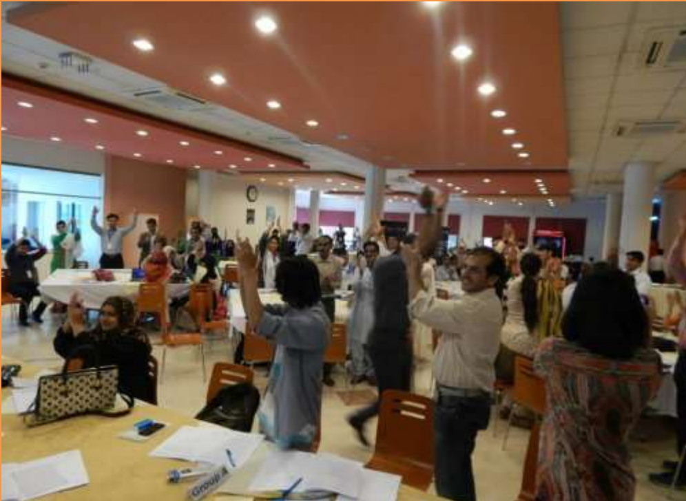
Cloture of global debate: final clapping