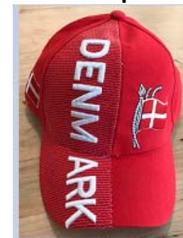
A Danish Hat