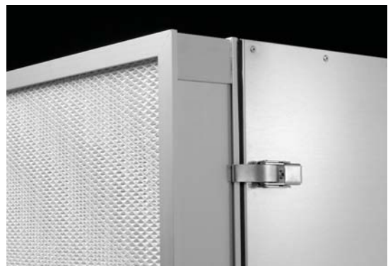
Latches seal and hold the AstroCel® filter securely to the module.