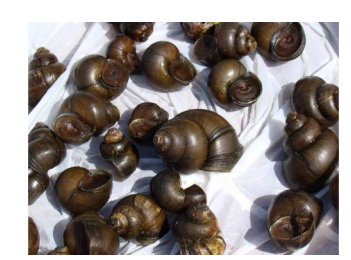
Chinese mystery snail