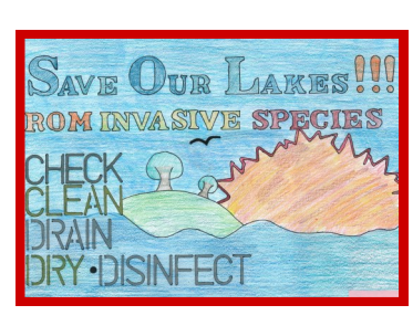
Summer Kiggins—Drummond Division 7/8