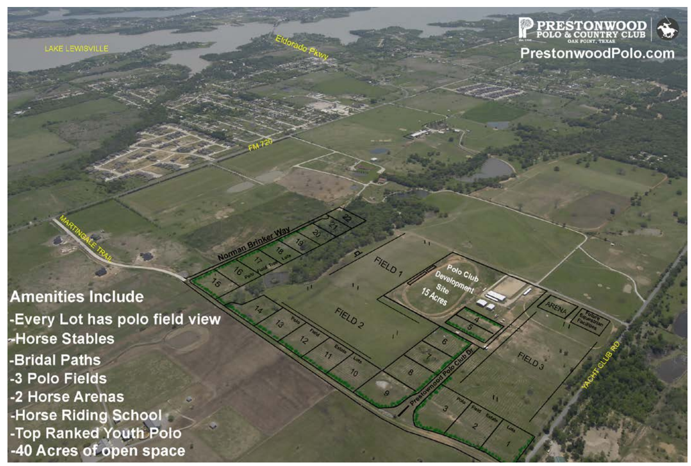
Prestonwood Polo Home Lots For Sale