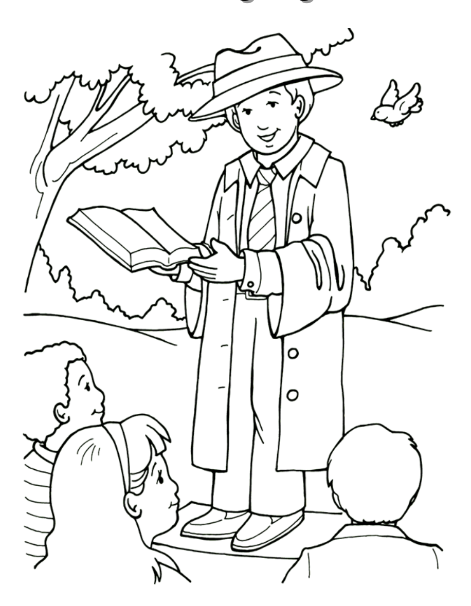
Inviting others to Jesus.

From Thru-the-Bible Coloring Pages for Ages 4-8. © 1986,1988 Standard Publishing. Used by permission. Reproducible Coloring Books may be purchased from Standard Publishing, www.standardpub.com, 1-800-543-1301.