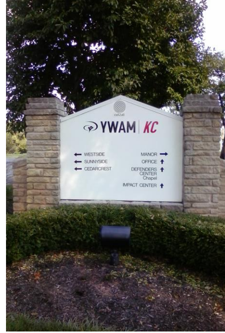
University of the Nations, Kansas City

We're finally back in Michigan for December and the holidays! We've had a rich fall in which, for a change, I was teaching not quite so far from home with three major trips, one to Kansas City , one to Dunham, Quebec and one to Toronto, Ontario.