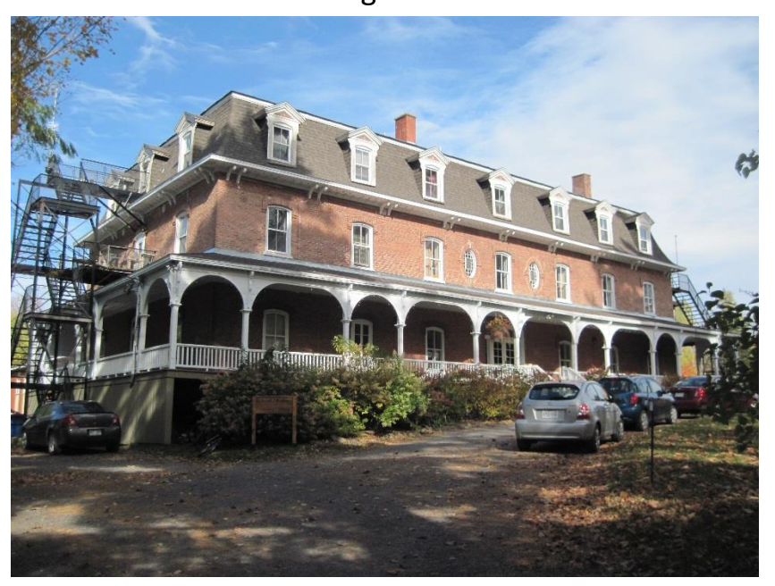
Main U. of N. classroom building in Dunham, Quebec

with a Mission. I taught there the last week of September and the first week of October in their Discipleship Bible School, covering the five books of the Pentateuch plus some lectures in World View as well. While there, I discovered a delightful Anglican church-plant called St. Aidan's, which meets in a school and has been growing steadily for about five years.