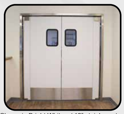
Shown in Bright White w/ 12" stainless steel kick plates and stainless steel hinge covers