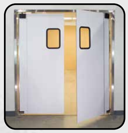
Shown in Bright White w/ black hinge covers