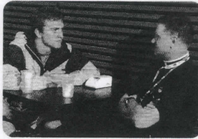
A pilgrim takes time during a World Youth Day event to speak with a priest about vocations.

If you are truly open to the will of God in your own life, if you are willing to listen to God's call and make your decisions and choices based on this experience, preferably with the guidance of a confessor or spiritual director, you will discover the true happiness that a real vocation can bring. ●