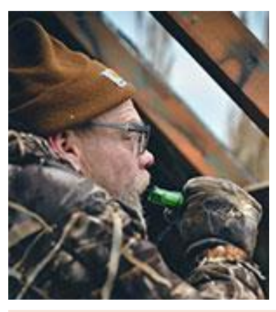
Smitty is cold & talking like a duck.

Want to share your love of the outdoors with kids?