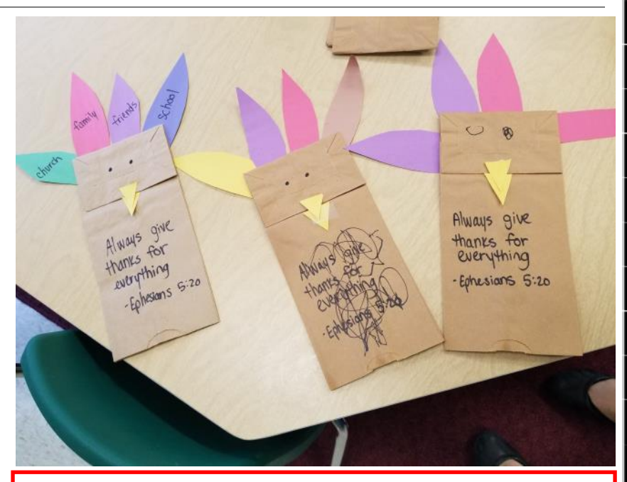
Thanksgiving turkey craft done by the Nursery.