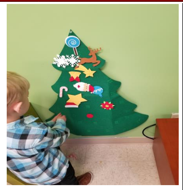
The felt Christmas tree used by the Nursery.

Come, Enjoy the Food and Fellowship At 5:15 PM the first three Wednesdays