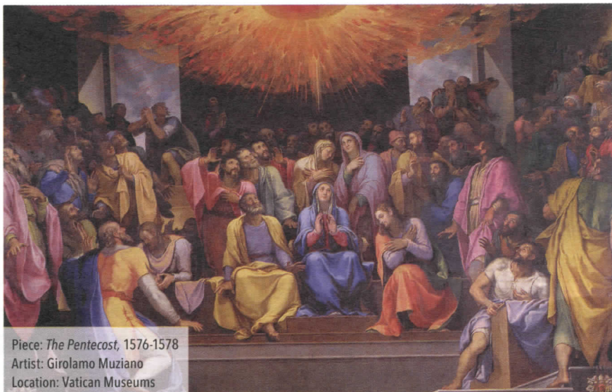
Piece: The Pentecost , 1576-1578 Artist: Girolamo Muziano Location: Vatican Museums

Jesus declared to the apostles at the Last Supper that the Holy Spirit would remind them of all he told them. Jesus gave this gift to the Church, and it's something we should value. How often do we do an internet search about a subject and then trust what a few articles say? Yet, are we as quick to look up what the Holy Father and the bishops say on different subjects in order to be guided by that light?