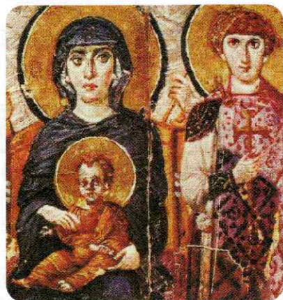
VIRGIN AND CHILD WITH ANGELS AND SAINTS

The first Christians did call Mary the “Mother of Jesus.” The title “Mother of God” wasn’t formally defined in the Church’s history until the First Council of Ephesus in 431. Around the year 250, the hymn Sub Tuum Presidium (“We Fly to Thy Patronage”) appeared, which refers to Mary as the Mother of God. Why did it take so long for the early Church to decide how to refer to Jesus’ Mother? What we call Mary is tied to how we understand Jesus’ identity as the fully human and fully divine Son of God. The Church understood Jesus as a person of the Trinity, the Son of God, who uniquely possesses both fully human and fully divine natures. In a nutshell, you can’t separate the “man” Jesus from the “God” Jesus. In clarifying what it meant to say that Jesus is the Son of God, equally one with the Father and the Holy Spirit and yet fully human and “like us in all things but sin,” the Church had to answer the question of how Mary fit into the work of salvation. Mary was the Mother of the Son of God; she was not only the Mother of Jesus’ human nature. When Catholics call Mary the “Mother of God,” they state their belief that Jesus is a single person—the Son of God—and that Mary is his Mother. ●