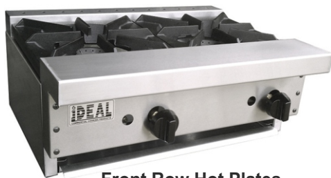
Front Row Hot Plates