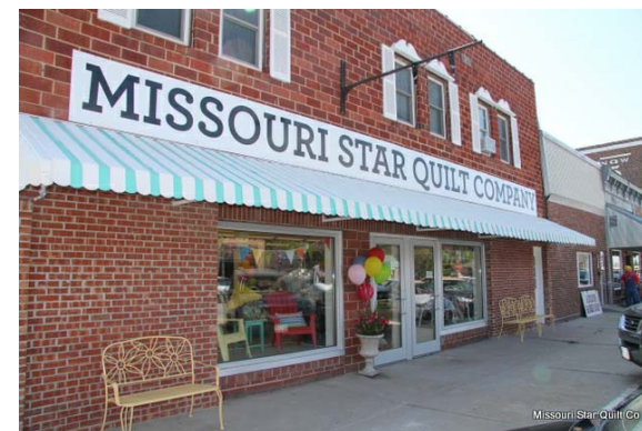
Missouri Star Quilt Co

Get ready for the ultimate quilting experience when today’s travels welcome us to Missouri Star Quilt Company in “Little ol’ Hamilton”, Missouri. This quilter’s paradise has been called the “Disneyland of Quilting”! A dozen shops line the main street and there is always something new for you to discover. Enticing restaurants have come to this quaint, little town and the owners can’t wait to meet you. After lunch we’ll gather our treasures and travel to Minnesota “piecing” together our colorful patterns of memories from our exciting quilting journey.