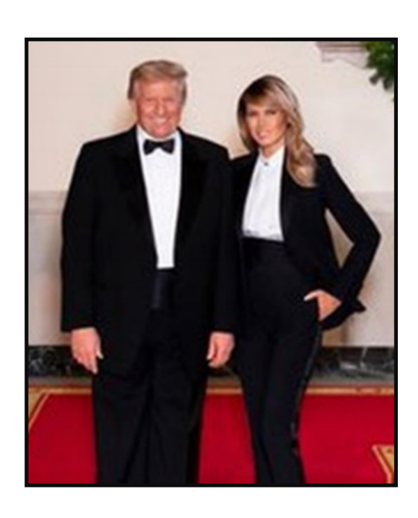
No wonder Carville & the Democrats hate Trump. One picture says it all.