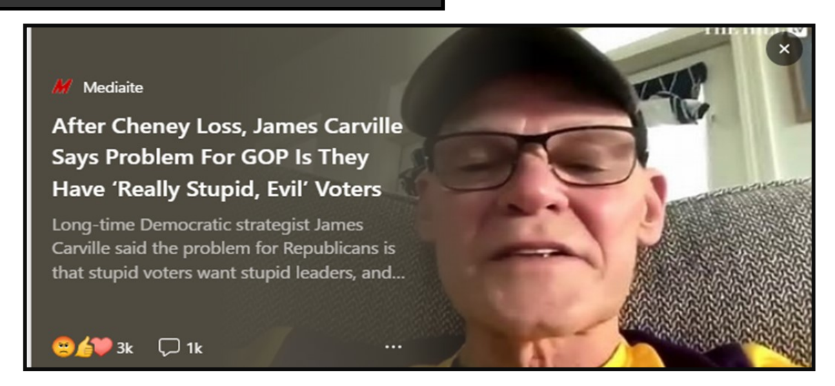
...that's where the Republican Party is."

Because Carville thinks he's so good looking and so smart...it's just guaranteed people will value his opinion!