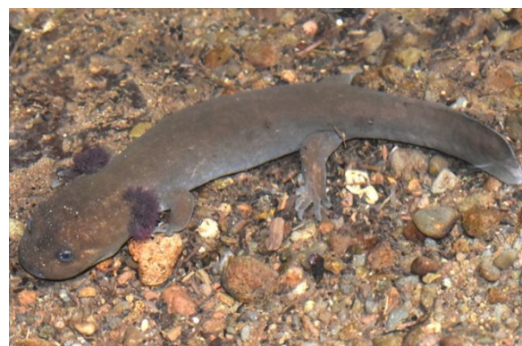
Coastal Giant Salamander