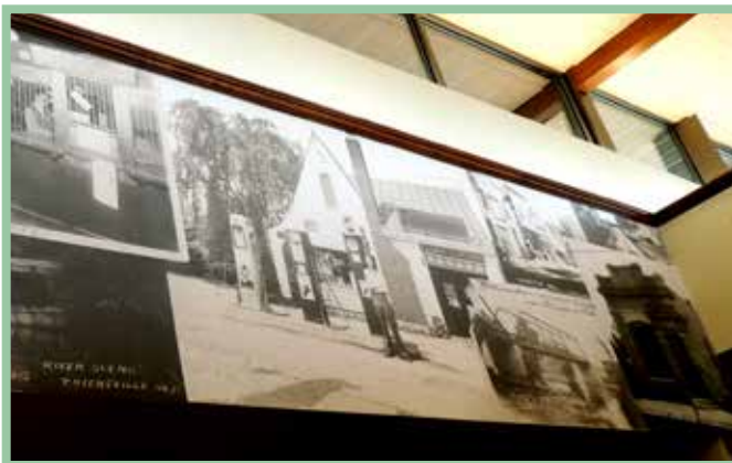
The newly opened Port Washington State Bank branch in Thiensville includes a fifty foot long mural of historic local photos including many from the MTHS collection. Be sure to stop in and admire this display of our local history.

Besides being a fundraiser for the Historical Society, we will also be celebrating The City of Mequon's 60th Anniversary on that day. Come help us celebrate both events!