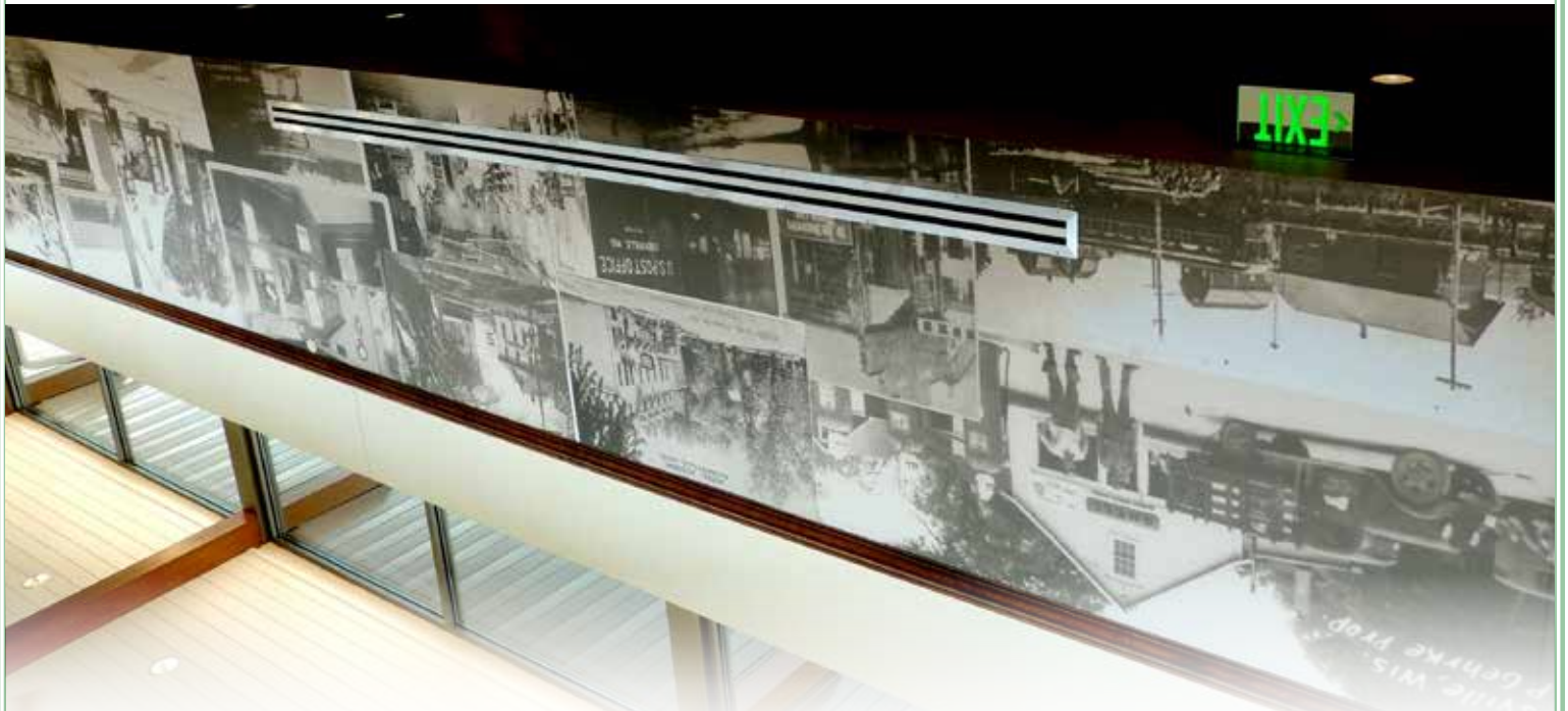
Pictured: A section of the collage of historic photos on display in the lobby of the new Thiensville branch of Fort Washington State Bank.