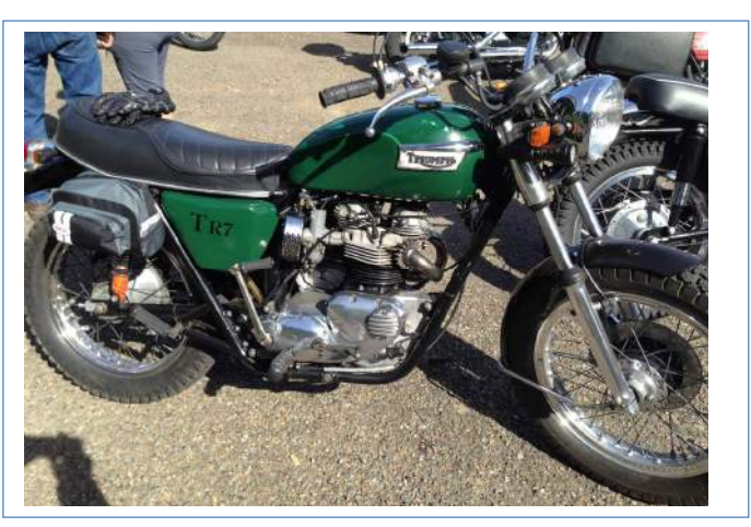
Spike Smith's Triumph Scrambler