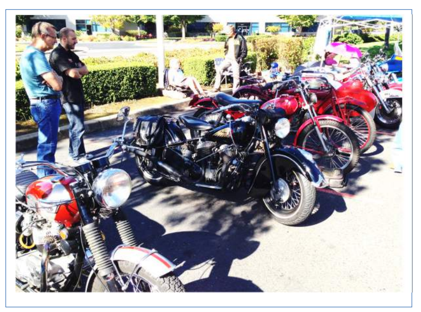
OTC Member Bikes on Display at Paradise Harley-Davidson, Tigard