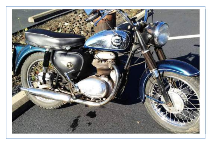
Terry Wolert's 1963 BSA 500cc