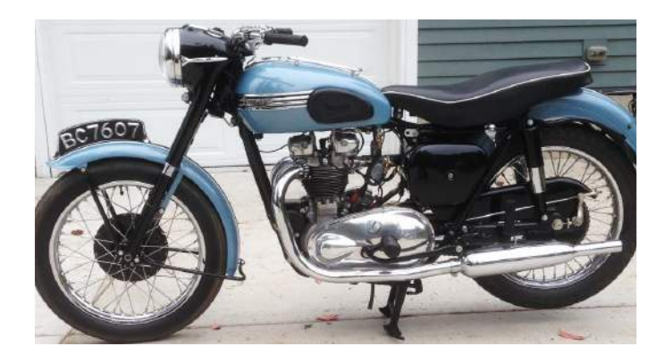
For Sale: 1956 Triumph Tiger 100 500cc

1956 Triumph Tiger 100 500cc The Pre-Unit Triumphs are a much desired and collectable. The classic design with the large gas tank, distinctive tank badges, parcel grid and nacelle set the standard for classic English motorcycle design in the 1950's. Includes innovative alloy, close finned 500cc parallel twin motor and all the 50's Triumph twin styling you could ask for. Originally exported to Malaysia, the bike was later brought to the US by an airline pilot. It was restored by a friend of mine who passed away two years ago - so I am selling it for the family. It is a previous award winner in the Oregon Vintage Motorcyclist club annual spring meet and show. It starts easily and runs well. The only functional issue is the horn is not working, although the correct horn is in place and the switch and wiring work correctly up to the horn. As will any older restoration that has been ridden occasionally there are a few signs of use (a couple of paint chips, etc.) but this is a great bike that would be a wonderful addition to any collection with the added benefit that it will show well at any bike show but can also be ridden. The bike was recently serviced and detailed in my shop which included an engine oil change, battery service and general check over. Valid Oregon title. Asking $12,000 and the family will listen to reasonable offers. The bike is located in Lake Oswego, Oregon. Additional photos and details upon request. Tom Ruttan (503) 621-8943, tgruttan@gmail.com