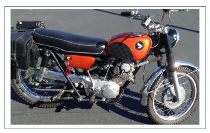
Stan Randall's 1967 Honda CL77, 305 cc