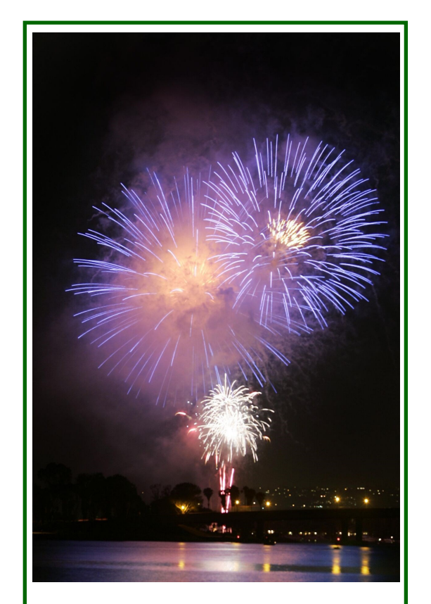
Happy Independence Day!

The Leadership Board meets on the third Thursday of the month at 5:30 pm. The next meeting will be July 20, 2023. All church members are welcome to attend.