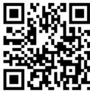
Figure 2. Example of a QR Code