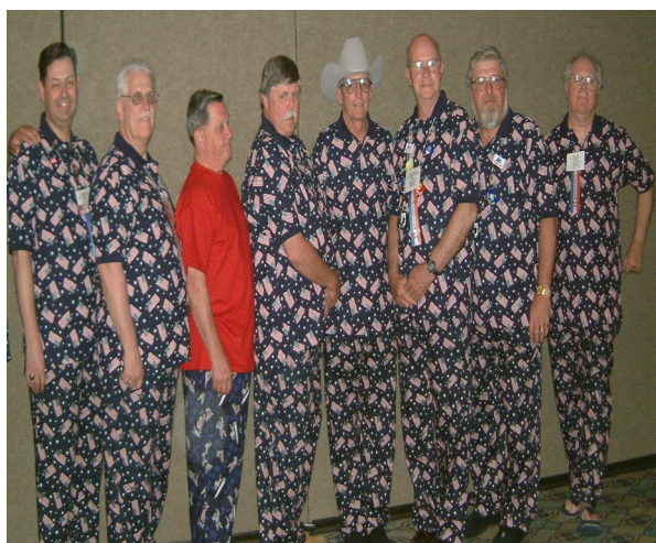
The Good Old Red, White and Blue