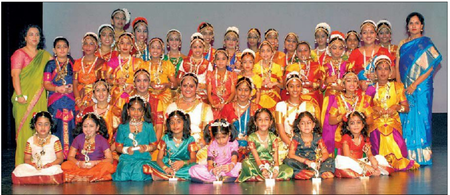
Dancers from Davie's Rhythms School of Dance performed "Festivals of India."

For more information, e-mail festival@erhythms.net or call 954-472-6004.