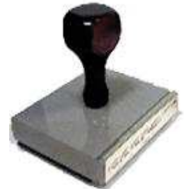
Jurat Stamp Oath/Affirmation Acknowledgement Self-inking $29.00 (Includes S/H)

DID YOU REMEMBER YOUR E&O? THANK YOU FOR YOUR ORDER!