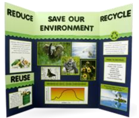
Display Board Example