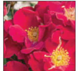
Top Gun S

We will be getting the roses in early March, they will be potted up in 5 gallon containers and the cost will only be $25.00 per plant. We only have thirty five roses so if you would like to pre-order you can put $10.00 down for each variety you desire at our February meeting, the balance can be paid on April 21, when you pick them up.