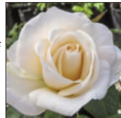
Easy Spirit Fl