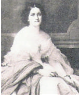
Madame Isaac Pereire, born in 1824, France.

For all of their high style, the Pereires didn't live in a glamorous bubble. They helped lead the Saint-Simonian movement, which supported the rights of laborers. Isaac, who was awarded the Legion of Honor for his philanthropy, promoted his ideas through his own daily newspaper, La Liberté ; he also established a generous prize for writing on social economics.