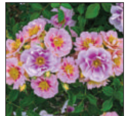
Easy on the Eyes S