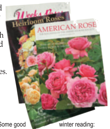
Some good winter reading: the ARS Annual and rose catalogs.