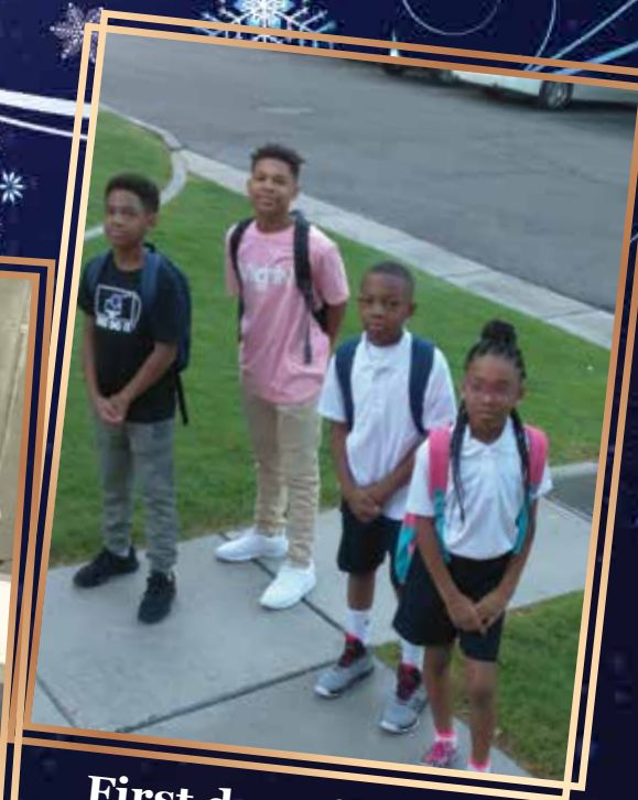
First day of school