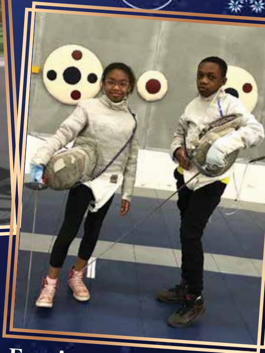
Fencing classes at our afterschool programs