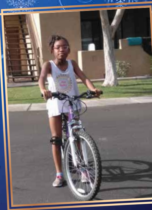
New bike from Save the Family