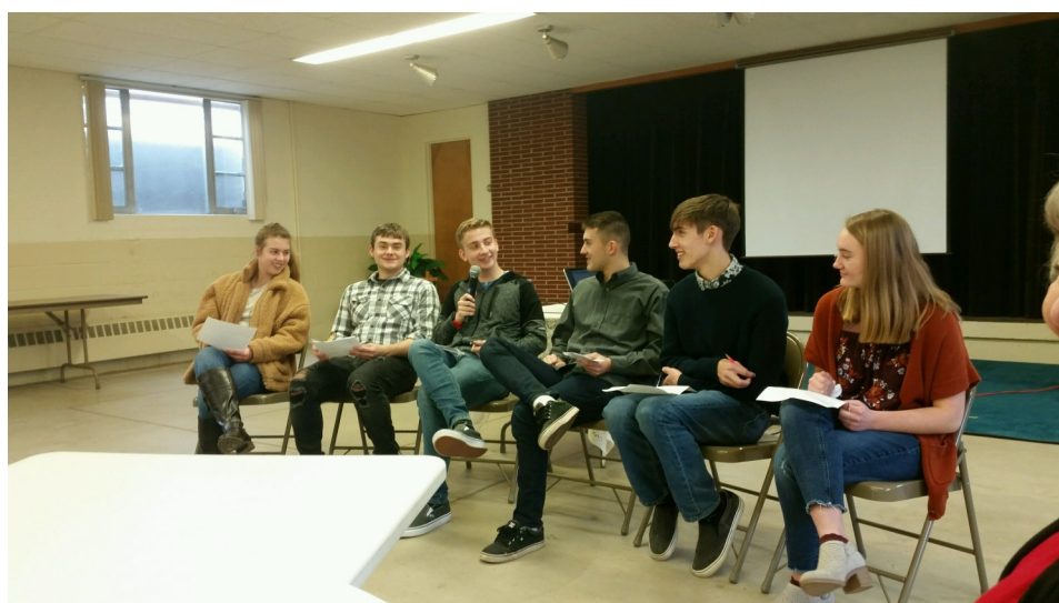
Catching up with the Youth January 5, 2020—Question and Answer Panel

We welcome all who are on the journey to know Jesus, who share in his love and who choose to embrace the diversity within this community of believers. As individuals we may be at different places along the path, but as a community, we are all traveling together in faith, trusting God to show us the way.