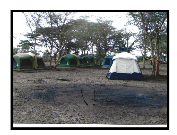
Our Bush Ministry "Home Sweet Homes"