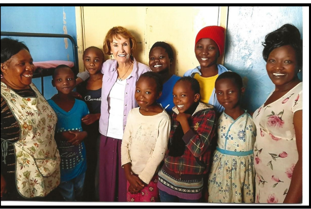
And these are some of the younger girls (pre-puberty) who call these dorm rooms home.