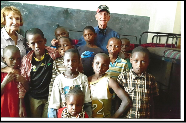
And their counterparts, some of the younger boys in one of their dorm rooms.

Every MCDC student identified as being high-risk (usually an orphan) and are approved to live in a dormitory room are furnished with a starter kit that includes: bar soap/personal hygiene supplies/toothbrush and toothpaste/flip flops/pajamas/mattress/sheets/blanket/pillowcase/washing bucket/school uniforms plus jacket/and a large metal trunk to keep all their personal items in which slides under their beds.