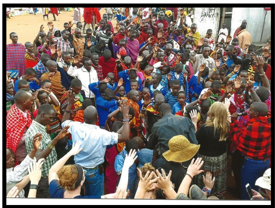
Maasai Village market ministry

In the late nineties we were introduced to East Africa bush ministry by Mike and Marigold Cheshier with Firewind Ministries. Their ministry took us to unreached areas in Maasia lands where they set-up camps from which we all preached the gospel in surrounding villages, bomas, schools and even under trees. Every camp was different, yet much the same. Tents were set-up, the camp kitchen was built around a fire pit and a cho (outhouse) was somehow enclosed and made private around a large hole in the ground. This bush ministry has been a big part of our lives for the last 23 years.