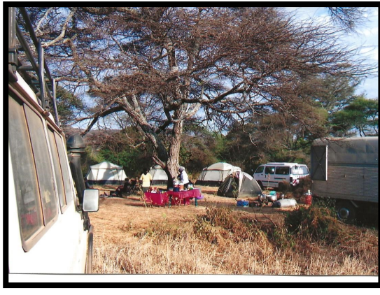
Another camp kitchen under a tree