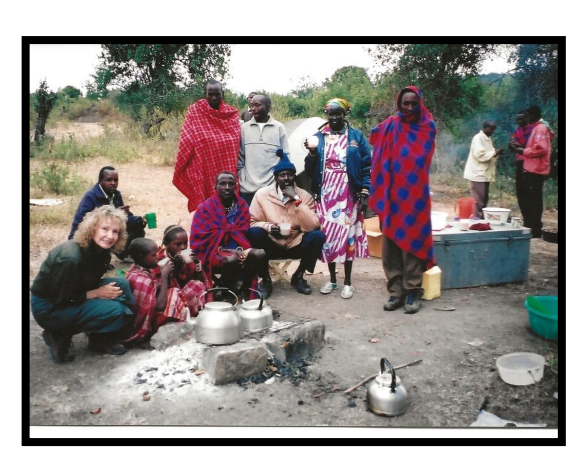
Typical Camp Kitchen