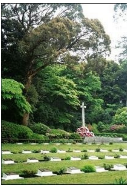
The Commonwealth War Cemetery near Yokohama contains the remains of nearly 300 Australian servicemen

While there were no charges of war crimes involving Camp 26, the paper trail for prisoner labor at Yoshikuma is clearly extensive. A 1982 book published by Japan's National Defense Academy also states that the camp's prisoners worked for Aso Mining.