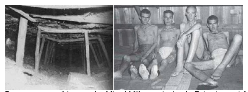
Dangerous conditions at the Mitsui Miike coal mine in Fukuoka and Allied POWs in Japan after liberation

Last year's flurry of media coverage reflected the nationalities of the World War II prisoners involved: 197 Australian, 101 British and two Dutch.