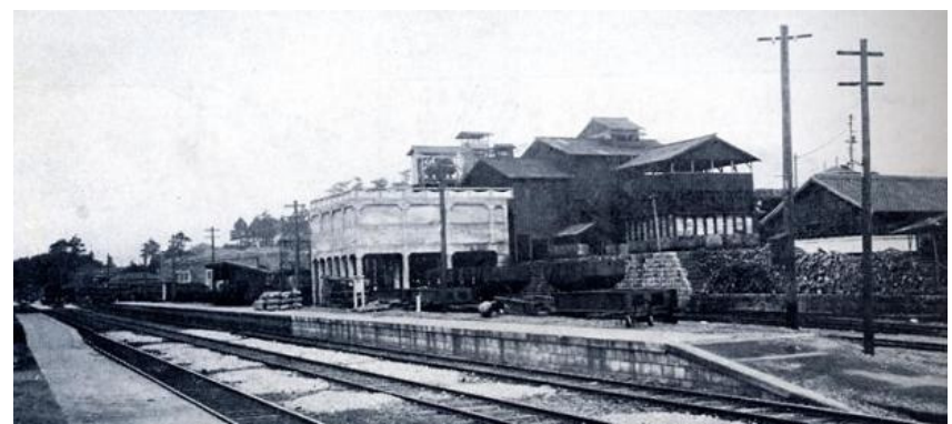
1933 photo of coal sorting equipment at Aso Yoshikuma mine in Keisen town, Fukuoka

(Also in 1945-46, Japan's Foreign Ministry similarly directed companies to submit extensive records concerning forced labor in Japan by Chinese nationals, many of them undeclared prisoners of war. War crimes against Chinese forced laborers were for the most part not prosecuted, however. The Japanese government suppressed the so-called Foreign Ministry Report and lied to the Diet about its existence, which was finally confirmed in 1993. Tokyo today describes the Chinese labor program as "half-forced.")