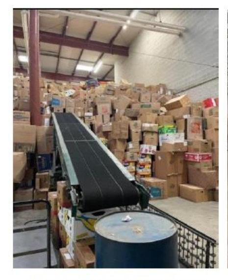
BOXES FROM INGATHERINGS ARE STORED AT MAIN DISTRIBUTION CENTER

In October, our quilts were dropped off at an ingathering in Zelienople, PA. The boxes of quilts are then transported to one of the main distribution centers for LWR in New Windsor, Maryland or South St Paul, Minnesota. At the distribution center, the boxes from the ingathering are moved by a conveyor belt and stored until they are ready to be repacked. The individual boxes from the churches are then opened, unpacked and the quilts are folded into a uniform shape. A compressor is used to stack 35 quilts, which are then compressed and baled. Each bale will weigh between 100 to 125 pounds. The bales are loaded on to pallets. Health, school & baby kits are also boxed in uniform boxes. The pallets are placed in a shipping container and shipped overseas to its destination.