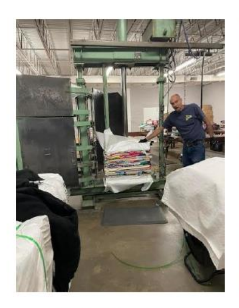
COMPRESSED QUILTS ARE BALED