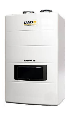
It has been just over a year since our new boiler system was installed and implemented.

OUR 2022 ANNUAL YEAR IN REVIEW MEETING HELD IN JANUARY IS RIGHT AROUND THE CORNER ON 1/15, SO PLEASE BEGIN TO PREPARE & SHARE YOUR COMMITTEE ANNUAL REPORTS WITH THE CHURCH OFFICE, AS WE THANK GOD FOR GUIDING OUR MINISTRY AT IMMANUEL FOR 80+ YRS!!!