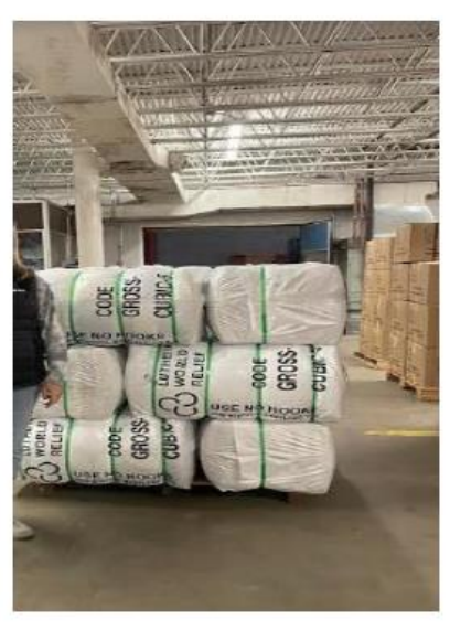
BALES OF QUILTS ARE PUT ON PALLETS AND READY TO LOAD ON THE SHIPPING CONTAINER