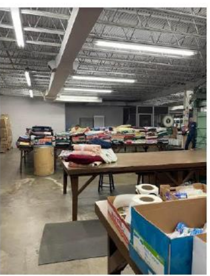
BOXES OF QUILTS FROM INDIVIDUAL CHURCHES ARE UNPACKED