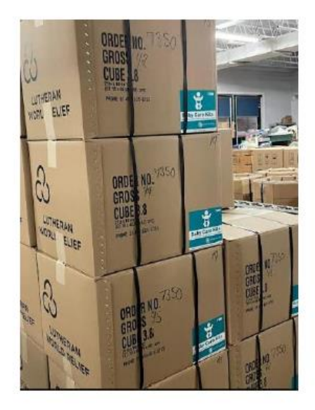
SCHOOL & HEALTH KITS ARE BOXED IN UNIFORM BOXES