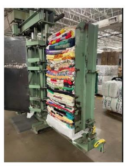
35 QUILTS ARE LOADED INTO THE COMPRESSOR