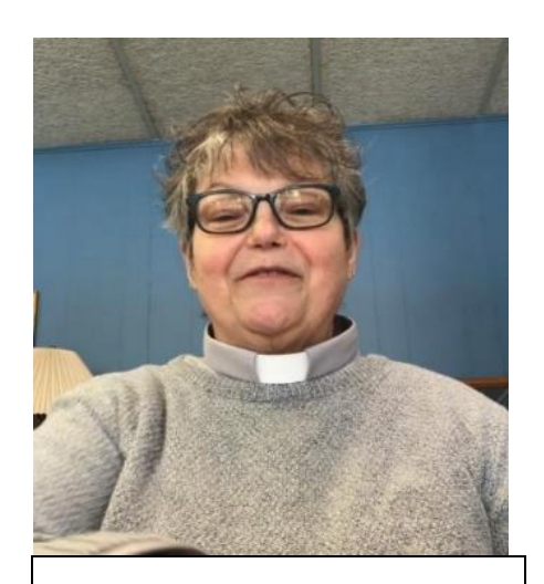
Grace & Peace from the Pastor's Desk