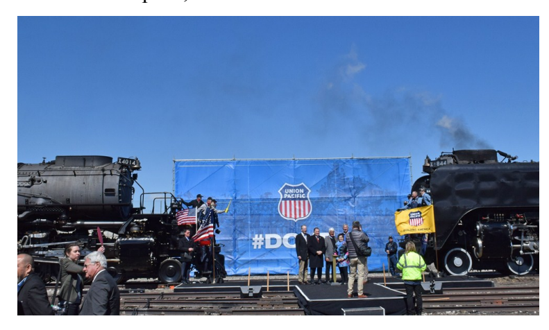
it was on to Promontory for the May 10<sup>th</sup> celebration.

After a ceremony in Ogden where 4014 and 844 did a nose-to-nose pose,