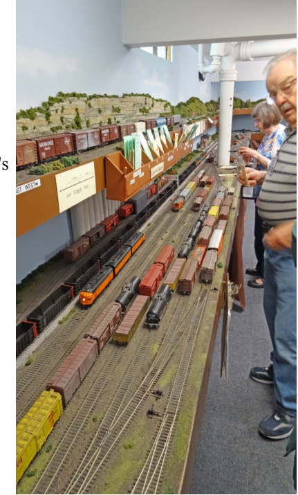
Operating at Al Lesky's