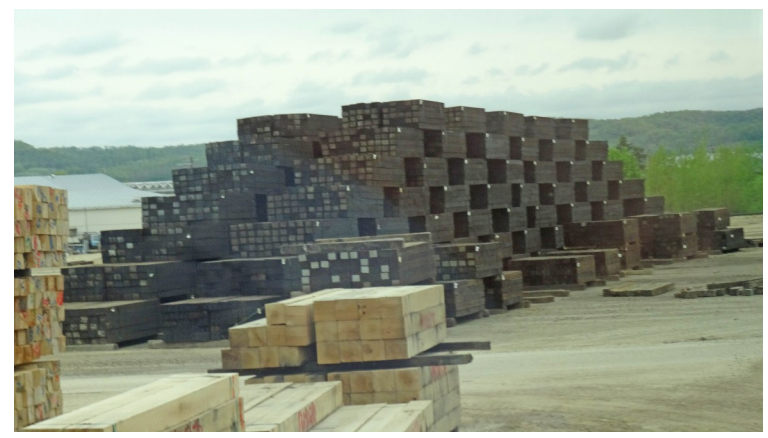
Ties - Hundreds piled at the Stella-Jones plant