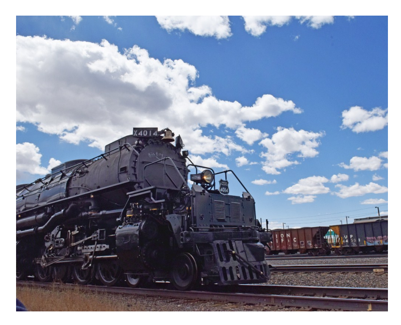
I think the population of Wyoming doubled that first two days, as the traffic heading west was at least two miles long.

After a "christening" ceremony at the Cheyenne depot Saturday morning, May 4<sup>th</sup>, Big Boy #4014, 4-8-4 #844 and SD70 #8937 led the special train on a five day journey to Ogden, Utah, the closest track location the Big Boy could get to Promontory. We were able to catch the train in a number of locations heading west, including Laramie.