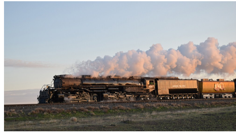
The weather was perfect until the last day. Leaving Evanston, Wyoming, it was 38 degrees, wind 25-30mph, rain and snow. And this was the best part of the route— Echo and Weber Canyons. Oh, well, it was still great to see.