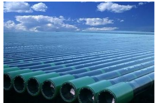
High Strength Anti Corrosion