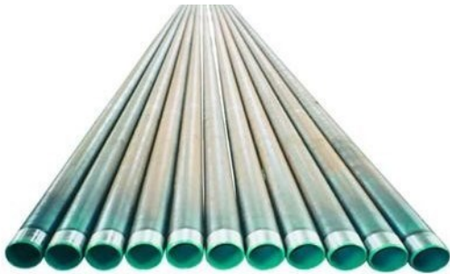
Epoxy Resin Coated