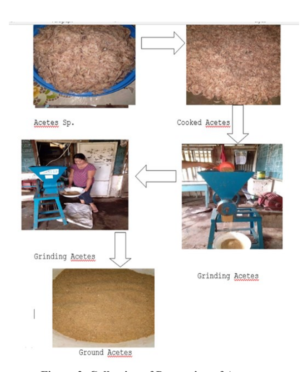
Figure 2. Collection of Processing of Acetes sp.