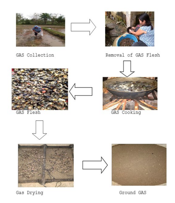
Figure 1. Collection and Processing of GAS

The fish were weighted and harvested after 60 days of culture, then sold to fish farmers at Php 10.00 each.