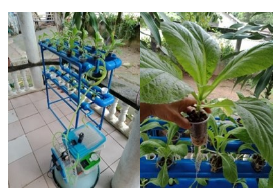
Figure 4. The First Prototype of Hydroponic Nutrient and Water Dispenser

Figure 3 shows that the researcher demonstrated the system and let the farmers observe and test how the system works. Also, try the functionalities and behavior of the device. The tester inputs values to check whether the device displayed accurate results. Also, some values will be calibrated to verify the application receives data correctly from the device. The device tester compared the actual outputs with the expected outcomes and detected any problem that arises, fixed, and re-tested.