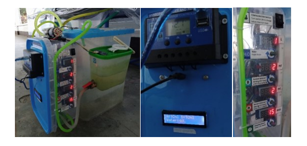
Figure 5. The User Interface of Hydroponic Nutrient and Water Dispenser

Figure 4 was the first system model that was custom-made per comments given by the users. Based on the second system, the system is built. Collecting the responses of clients in an organized way was very essentials for further system enhancements.