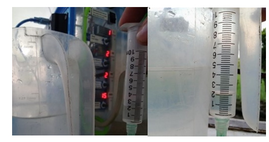
Figure 6. The Reliability test results of the device controller of Hydroponic Nutrient and Water Dispenser

Figure 5 shows the main user interface of the system where the user interacts that answers the objective 1 and 3. It shows the recorded resource usage from the start of the operation. These recorded data can be reset by the user using the reset switch after it was recorded for reference to start for another new recording.