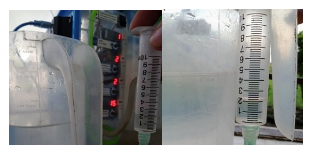
Figure 3. Testing the Accuracy of Hydroponic Nutrient and Water Dispenser

Once the client figures out the problems, the system is further refined to eliminate them. The process continues till the user approves the system and finds the working model to be satisfactory.