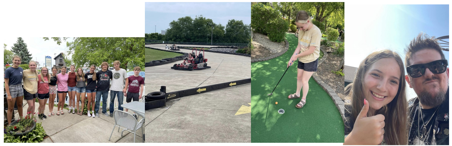
Youth Outing - Go Karts - Pizza - Putt Putt