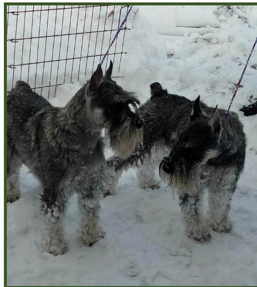
Schnauzers are always good for a romp in the snow!