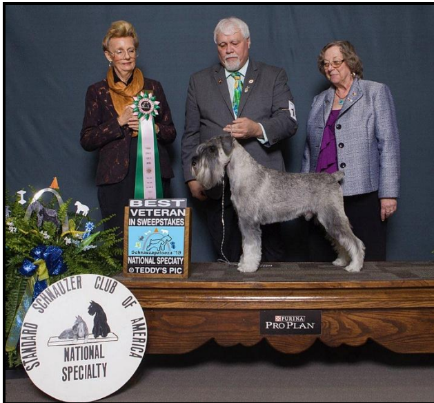
GCH Von Rose Commander Sparks “Sparky”