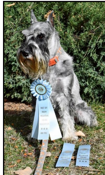
Lindy – new BCAT title (pending AKC approval)