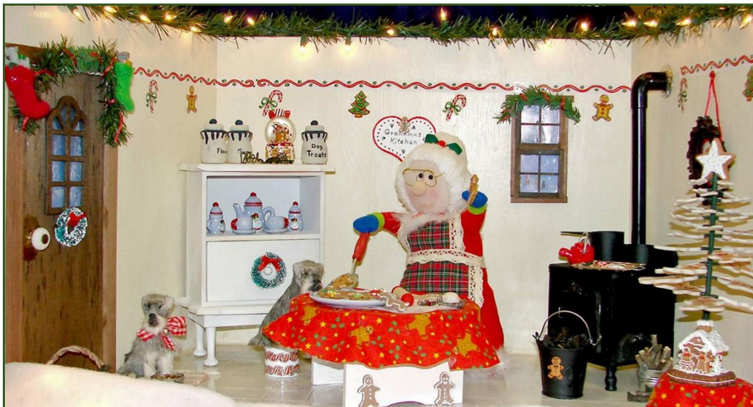
Close-up of Grandma's House in front of Schnauzer themed tree. All constructed by PSSC members.