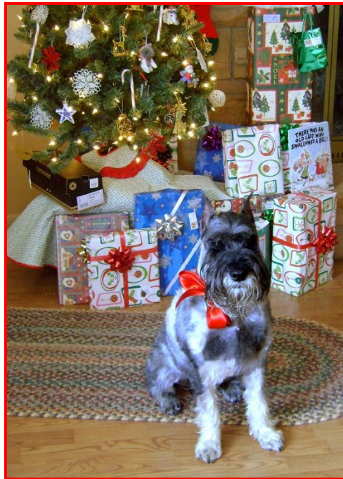
Jack under the Christmas tree - December 2008