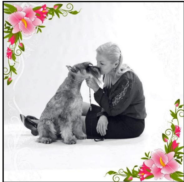
GCH Von Rose Enchanted Christmas Vision “Ivy”

We are hoping to see puppies out of our girl Ivy and Sparky toward the end of January. There should be some nice show quality pups available.