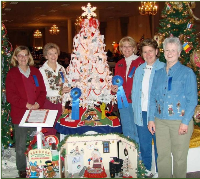
PSSC tree designers taken at Bloomington IL Interstate Center