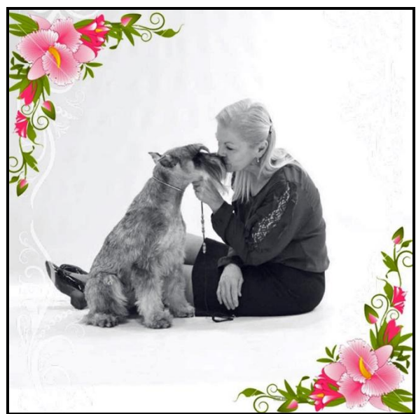
GCH Von Rose Enchanted Christmas Vision "Ivy"

We are hoping to see puppies out of our girl Ivy and Sparky toward the end of January. There should be some nice show quality pups available.