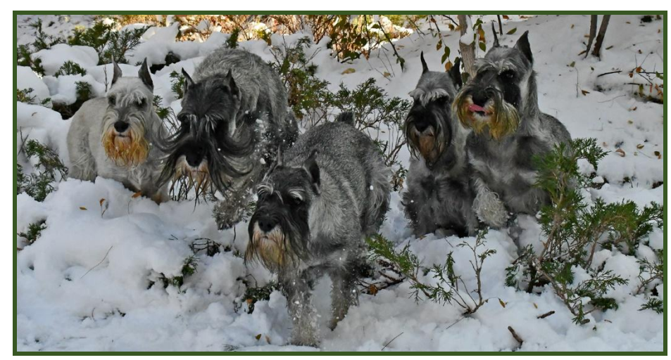
Good bye 2020... We are out of here!!!!