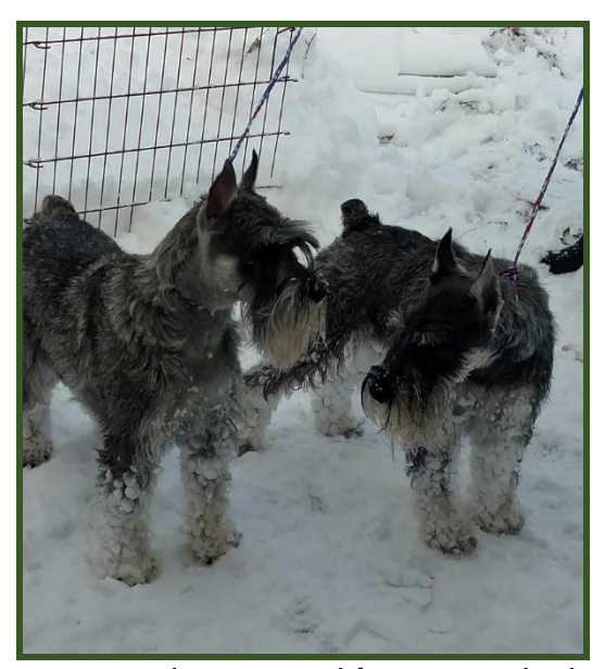
Schnauzers are always good for a romp in the snow!