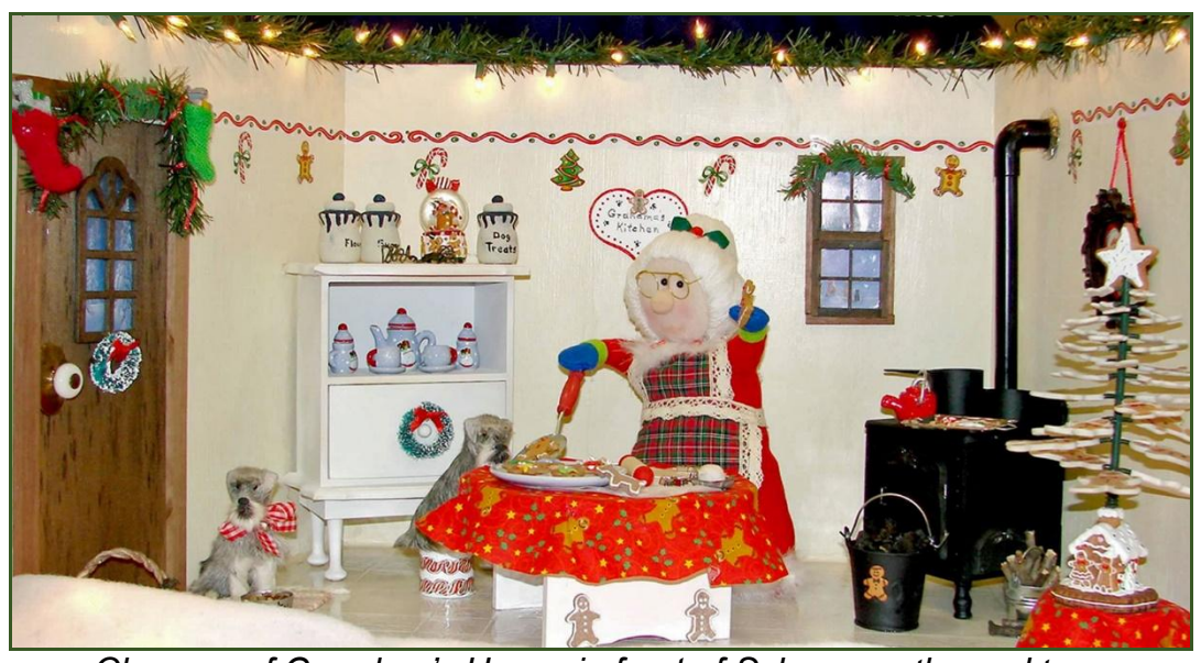
Close-up of Grandma's House in front of Schnauzer themed tree. All constructed by PSSC members.