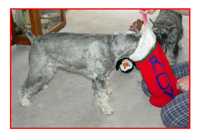
AKC Rally® Virtual Pilot Program

Other changes in obedience can be found here: https://www.akc.org/sports/obedience/news-updates/