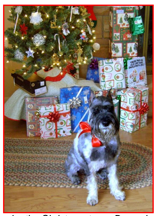
Jack under the Christmas tree - December 2008