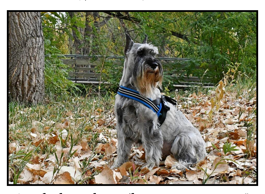
CH Himmlisch Reach For The Stars In Cassiopeia "Cassi" MX, MXJ, MXP, MJP3, MJPB, TKI AKC Achiever Dog SSCA Preferred Agility Dog of the Year - 2019 July 6, 2008 – October 30, 2020