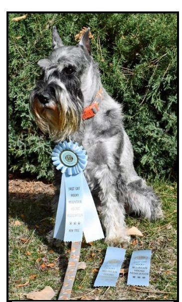
Lindy – new BCAT title (pending AKC approval)