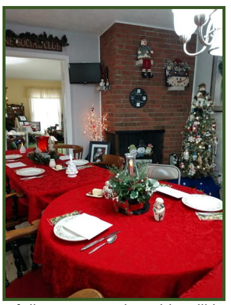
Hopefully next year the table will be full again with all of our members celebrating together. . . we all have a lot of good memories of PSSC Christmas parties and crazy gift exchanges over the years!!!

Bob Wiegel won the high bid on the tree and enjoyed the tree every year until he passed away in early 2010.