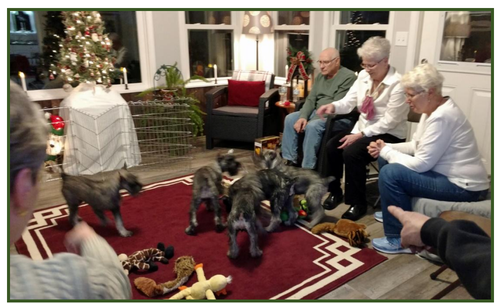
At our Christmas party 2 years ago, the after dinner entertainment was 5 crazy Schnauzer puppies – those are the grey blurs in the photo!!