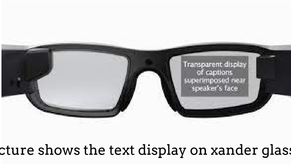
Picture shows the text display on xander glass