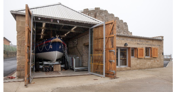
East Durham Heritage and Lifeboat Centre

You can learn more about the history of Seaham and the marina by visiting the East Durham Heritage and Lifeboat Centre , home to the famous George Elmy Lifeboat.