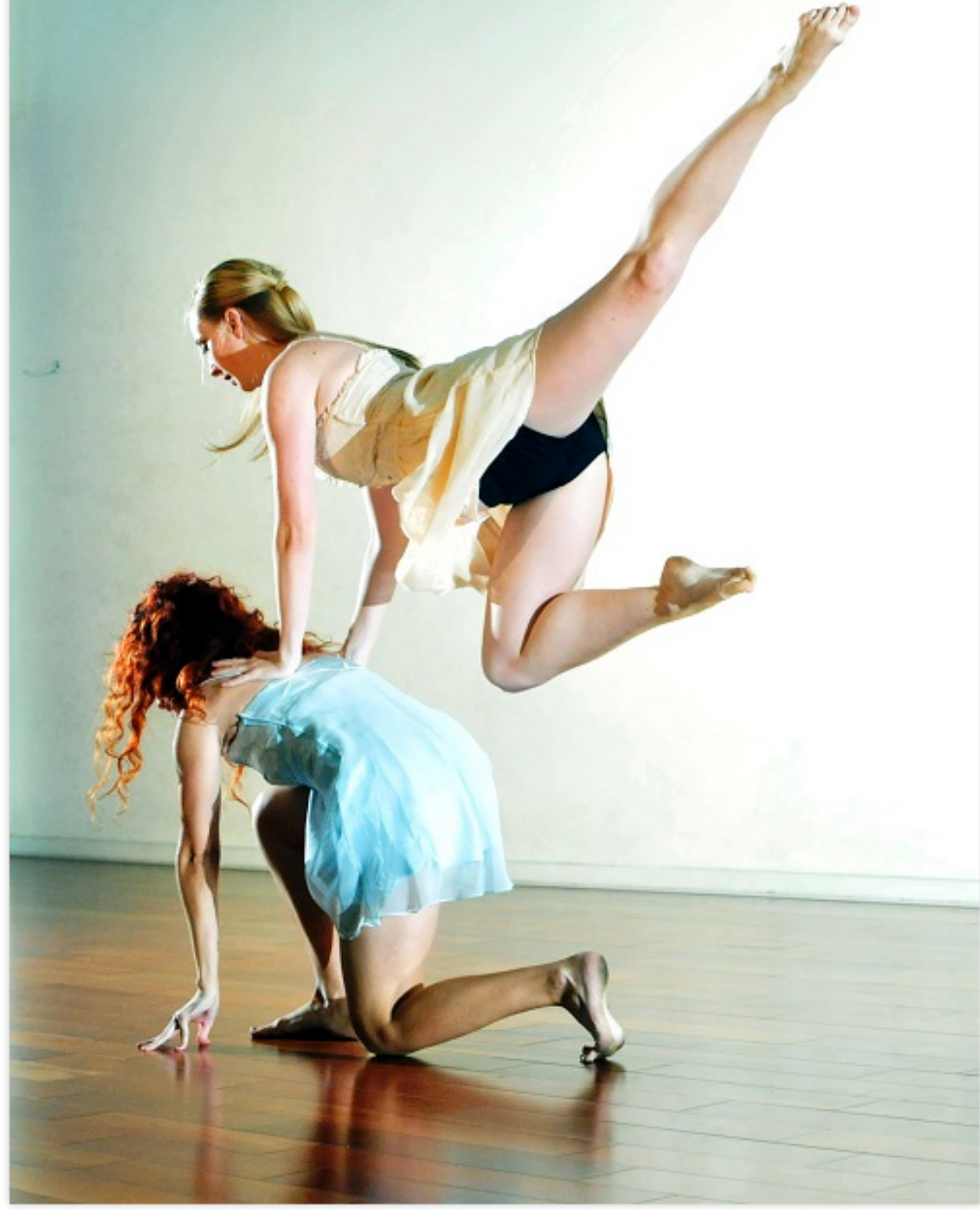
Rubans Rouge Dance Company (California)