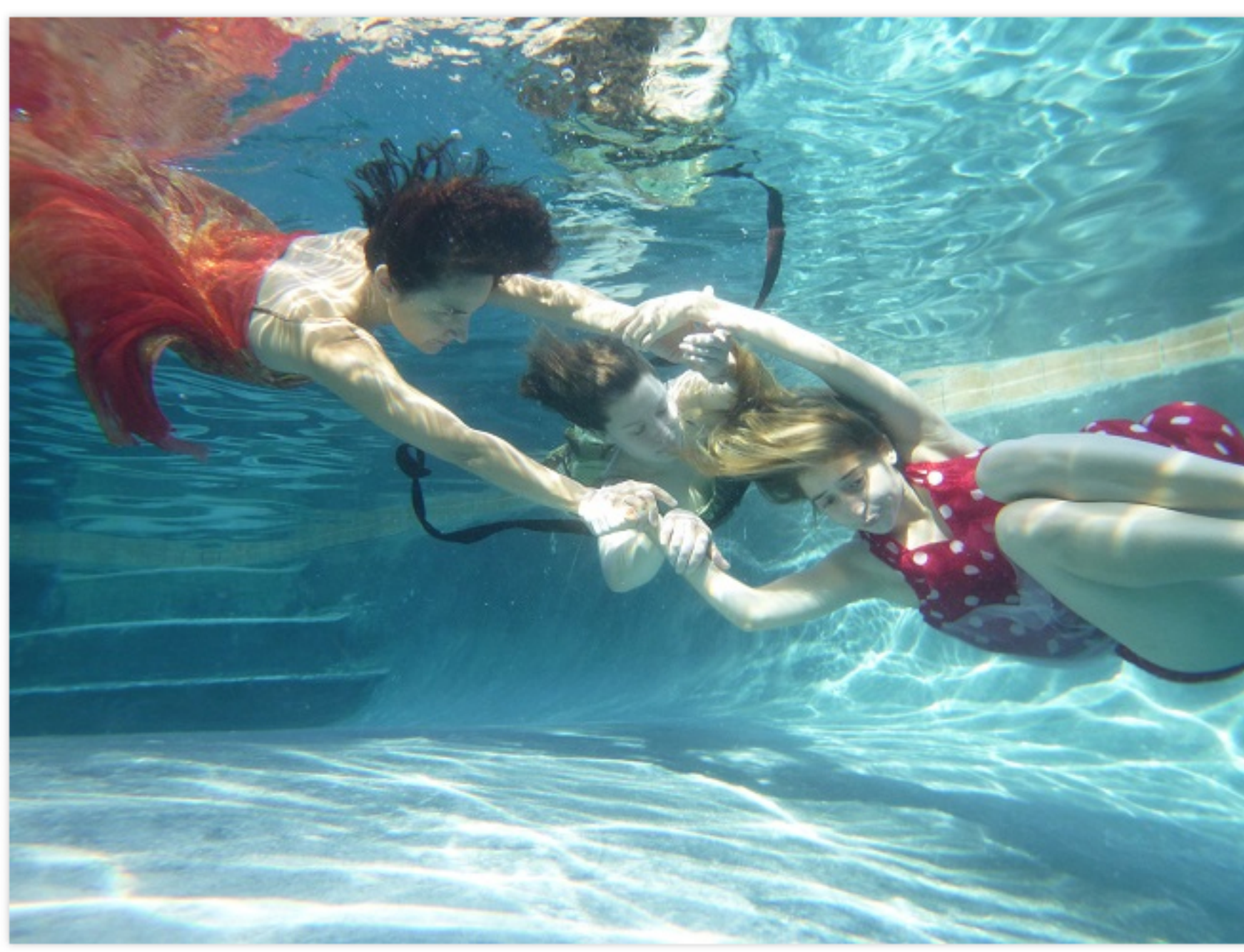
ArtBark International

ArtBark International and Friends organize the 2013 bi-coastal ADaPT (A Dance and Physical Theater) Festival with performances by artists from California, New York and Slovenia