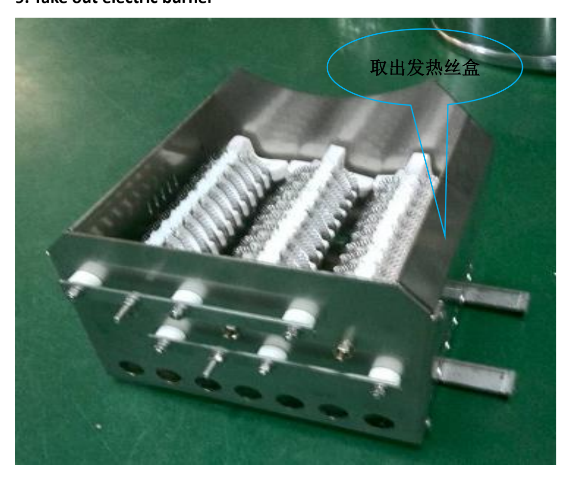
PS: Installation steps are contrary to disassembly steps.