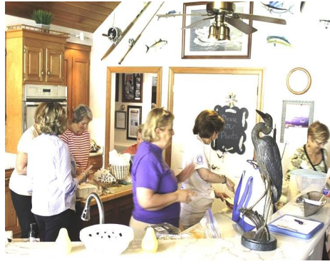
As they do every Spring and Fall, members of the Women's Club of Yorktown prepared and served the picnic lunch for our day of fishing and boating with the disabled veterans