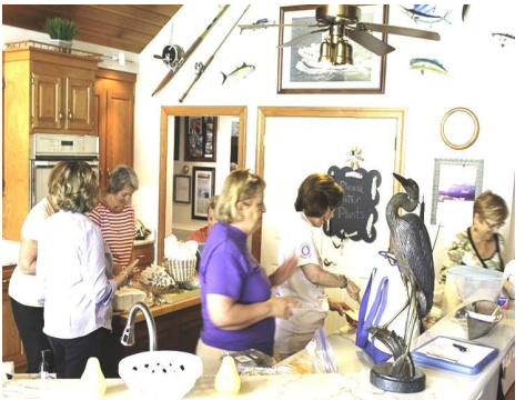
As they do every Spring and Fall, members of the Women's Club of Yorktown prepared and served the picnic lunch for our day of fishing and boating with the disabled veterans