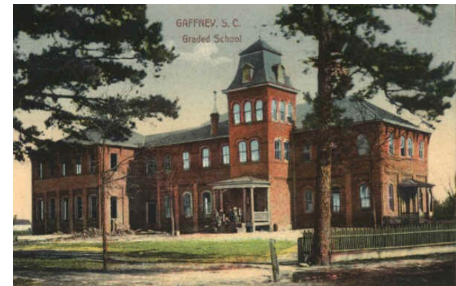
Original Central School Building, c. 1900